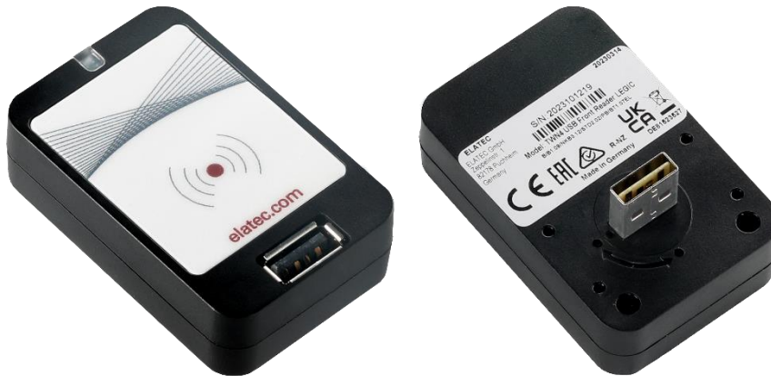
TWN4 USB Front Reader LEGIC (exemplary illustrations)

Multi-frequency RFID reader (LF/HF) with NFC and BLE support